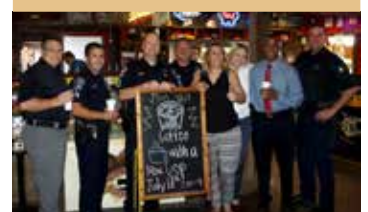
Officers enjoyed meeting the community at Coffee with a Cop on July 18.