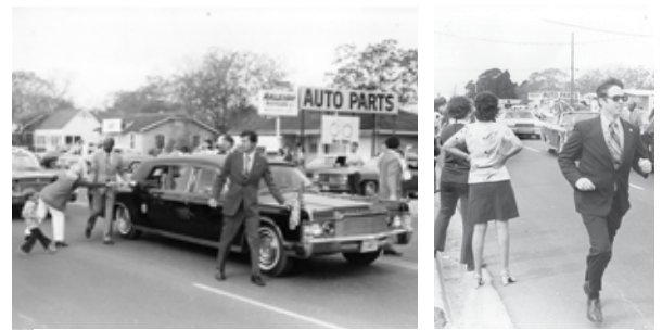
1974: President Nixon visits Webster